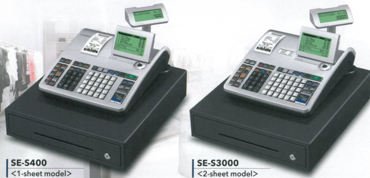
SE-S400 <1-sheet model>