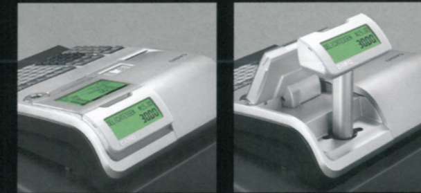
Large pop-up display

An alpha-numeric pop-up customer display ensures high visibility for the customer. Gain trust from your customer with a mistake-free cash register operation.