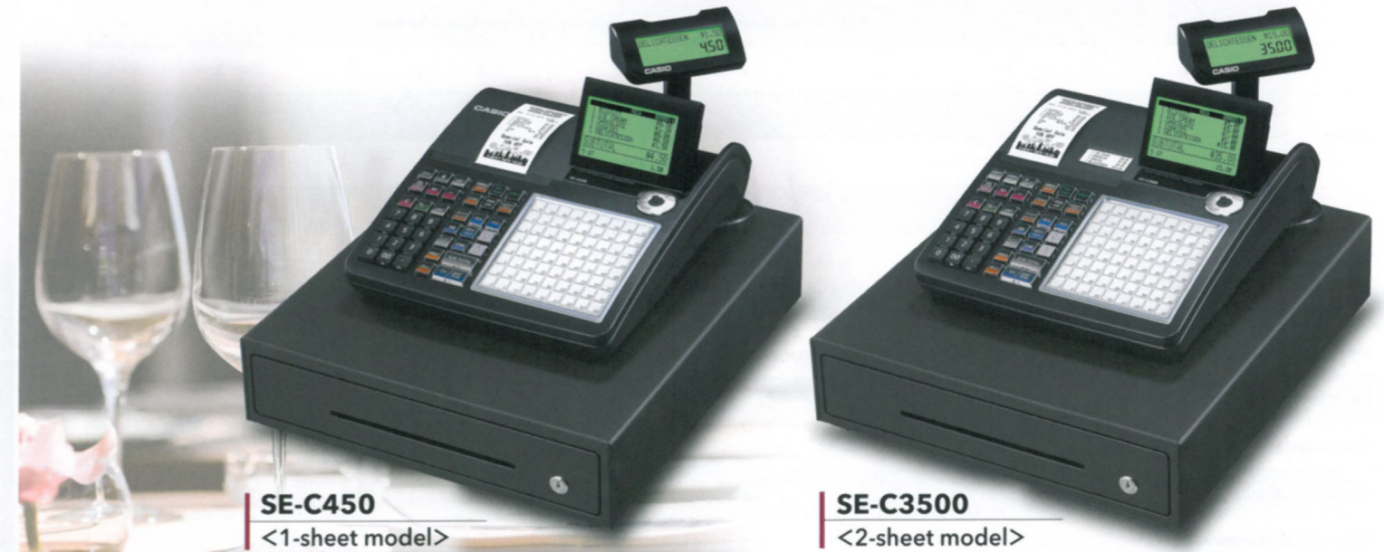
SE-C450 <1-sheet model>